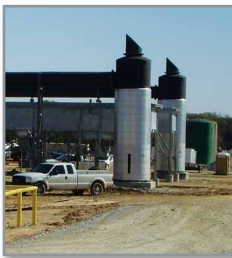
Ground Access Installation