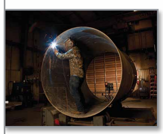
Silencer Body Manufacturing

MIRATECH catalytic converters are better designed and better built so they work harder, longer, at less cost and with less maintenance than traditional converters. For example, MIRATECH produces catalyst elements through chemisorption catalyst impregnation. The result? Long-lasting, cost-efficient, poison-resistant performance. MIRATECH also fabricates its housings with carbon or 304 stainless steel while the VORTEX® substrate is your assurance of superior thermal durability and mechanical strength. These combos also utilize VORTEX® elements which use a revolutionary substrate with static mixing and turbulence to create an element that is more efficient and durable than comparable industrial engine catalysts with a traditional open-foil design. Plus, VORTEX® elements have a two-year warranty.