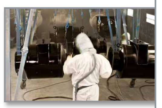
IQ Housing Paint Process

Quick to install and a breeze to maintain, IQ sets the standard in cost-efficient catalytic performance. Call MIRATECH or get a quote from the website to find out how quickly and easily you can put the IQ or any of the MIRATECH Innovative Emissions Solutions to work for you. www.miratechcorp.com