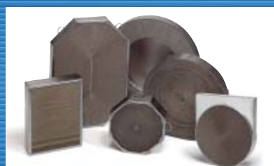
»Catalyst Elements Wash, Repair & Replace With MIRATECH

Why MIRATECH replacements? Simple: They're better designed and better built. So they work harder – with less trouble, less maintenance, and less life-cycle cost.