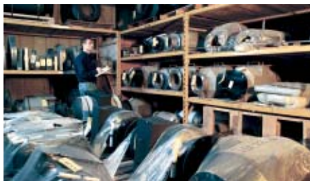
▶ A MIRATECH Hallmark Better Designed, Better Built Catalyst Elements

The catalyst elements you've paid for and rely on to keep your business in compliance with emissions regulations need regular, proper service to get the job done.