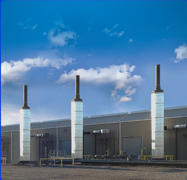
GROUND ACCESS INSTALL